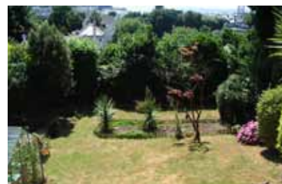
Private walled garden