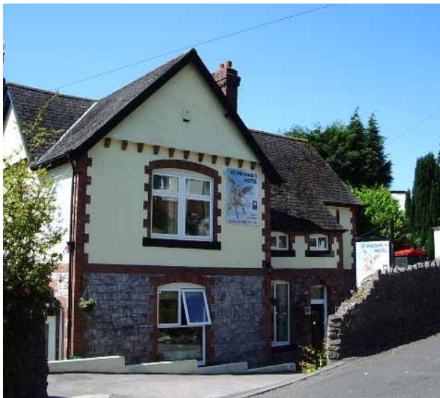
St Michael's Residence

St Michael's consists of 6 tastefully decorated twin and double rooms with a capacity of up to 12 students. Each room has tea and coffee-making facilities, central heating, heated towel rails and a hair dryer, as well as an en-suite bathroom. Some rooms also enjoy stunning sea views. There is a large fully-fitted kitchen available to students, plus a communal dining room and lounge with satellite television. The residence benefits from a south-facing sun terrace and walled garden. Wireless broadband Internet is available throughout the building.