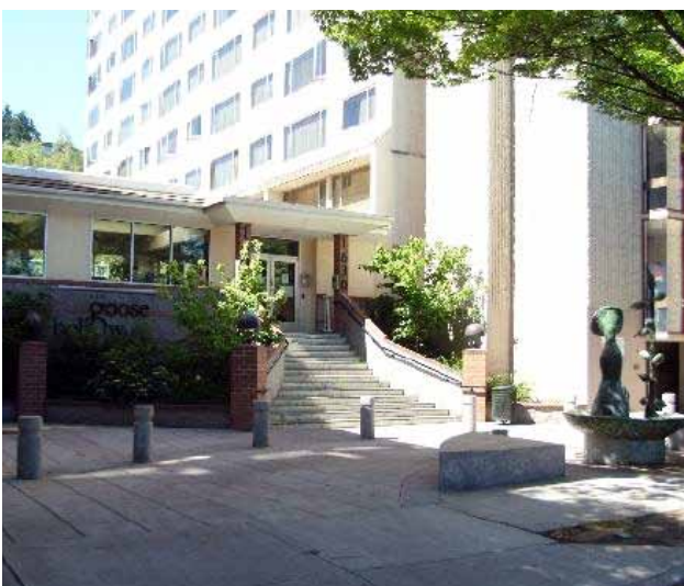
Goose Hollow Tower

Goose Hollow residents live in a true student environment. All residents attend one of the various schools in the Portland area. Kaplan students will enjoy meeting students from across the USA and the world. For students interested in making friends in the USA, this residence is ideal.