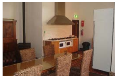
Kitchen / dining