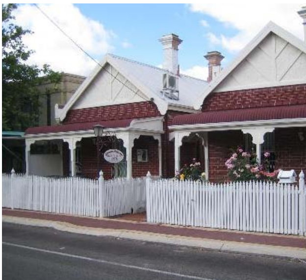
Governor Robinsons Hostel

The hostel provides individual lockers in all the rooms to accommodate all luggage and offers security for belongings. There is internet access available. Guests have a kitchen at their disposal. Governor Robinsons is an excellent hostel, catering for those who want a more upmarket hostel experience.