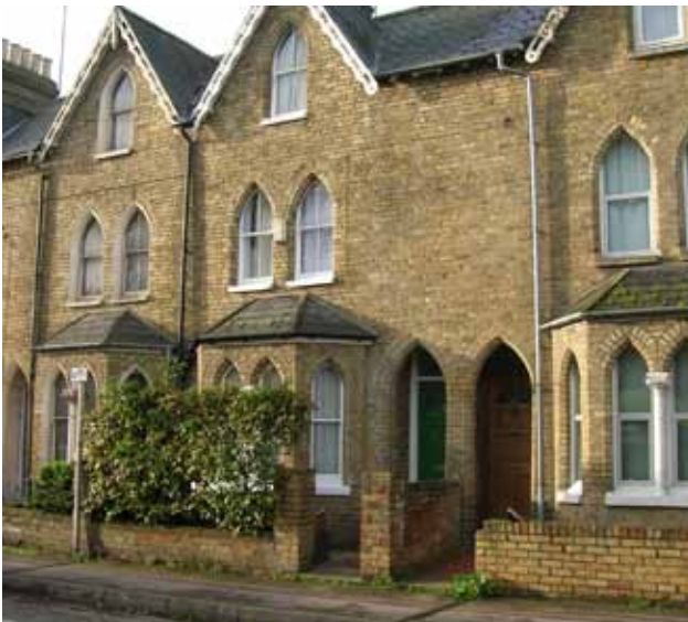
One of the St. Clement Apartments

The apartments are in the lively St. Clements area of Oxford, a short walk from local shops, restaurants and the town centre, and directly opposite a large park. Cowley Road, with local sports centres, pubs, supermarkets and night clubs, is located a 2-minute walk from the apartments. The accommodation is also a 20-minute bus ride from the college on an excellent bus service. The apartments are maintained and managed day-to-day by an on-site warden.