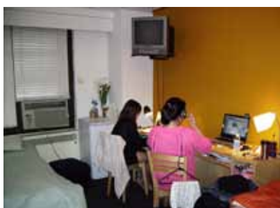
Fully furnished room*