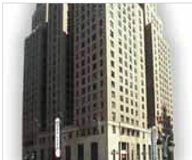
The New Yorker