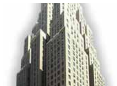
New Yorker Residence