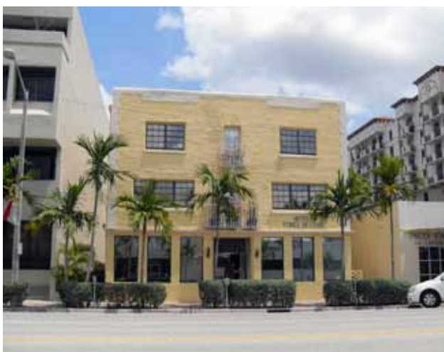
Ponce De Leon Hotel

The Ponce De Leon is ideal for students who want to be close to school. A free trolley ride takes you straight to the Kaplan Miami Center, which is located just 5-10 minutes down the same street, Ponce De Leon Boulevard. This pedestrian friendly area is also 45 minutes away by car from Miami Beach, Downtown Miami, and other South Florida attractions.