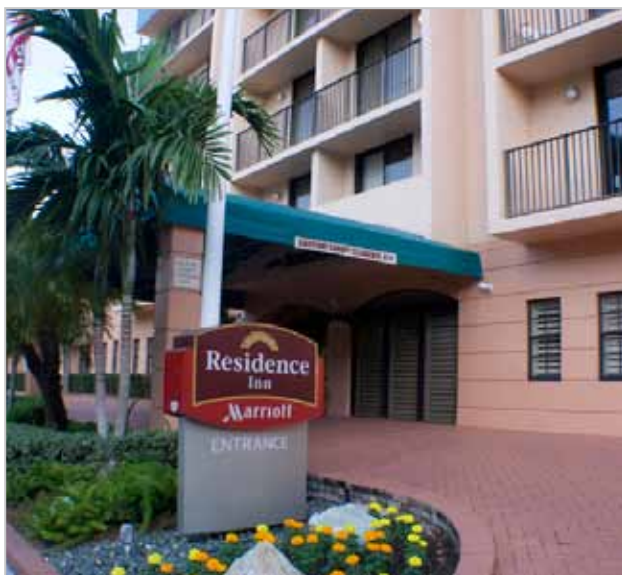
Residence Inn by Marriott

The Residence Inn is 20 minutes from Downtown Miami, and 30 - 40 minutes away from the beach by car.