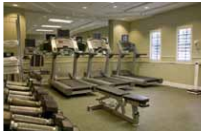
Marriott fitness center