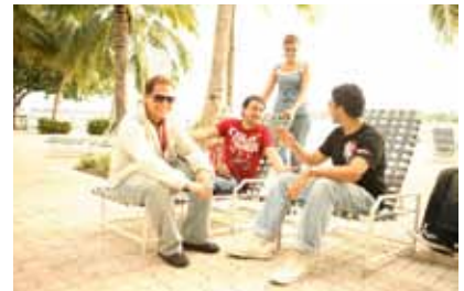
Guests of Marriott Inn enjoying the beach