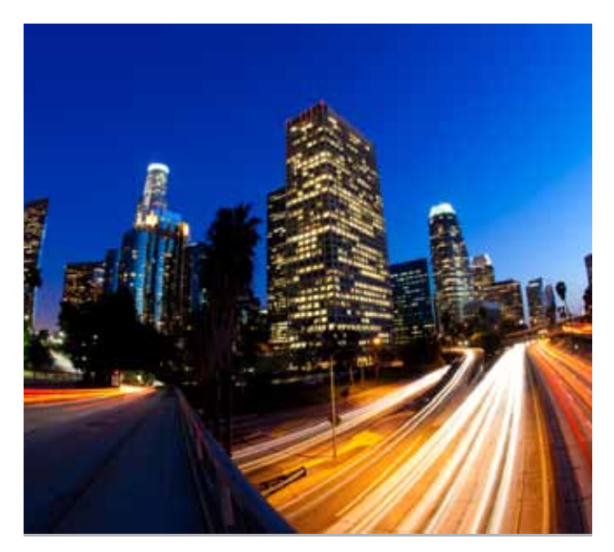
Los Angeles at night