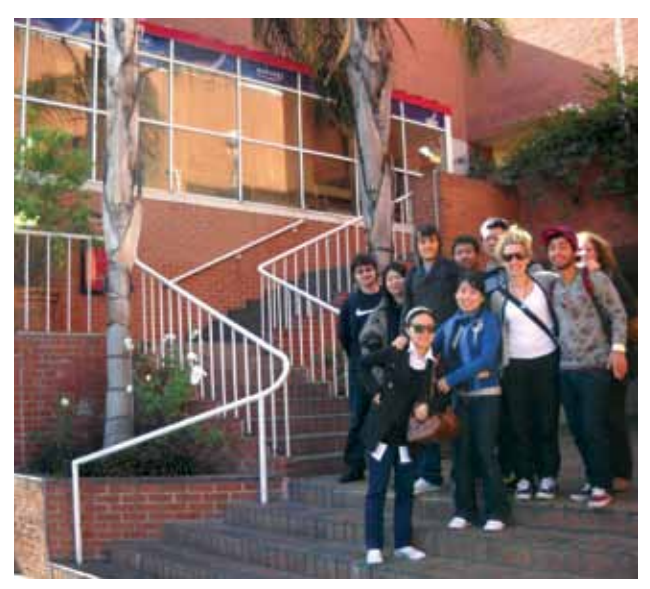
Kaplan International Center Westwood

We encourage you to take full advantage of our excellent educational quality programs and the overall experience of studying and living in the United States. Many of the Westwood students use our University Placement Services and transfer to Santa Monica College, which has a high transfer rate to schools like UCLA and the University of Southern California (USC).