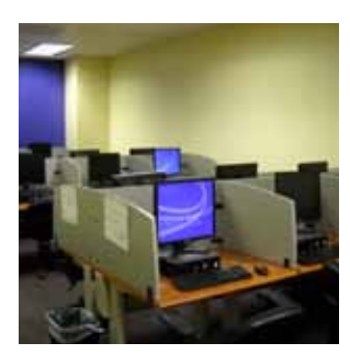
New computer lab