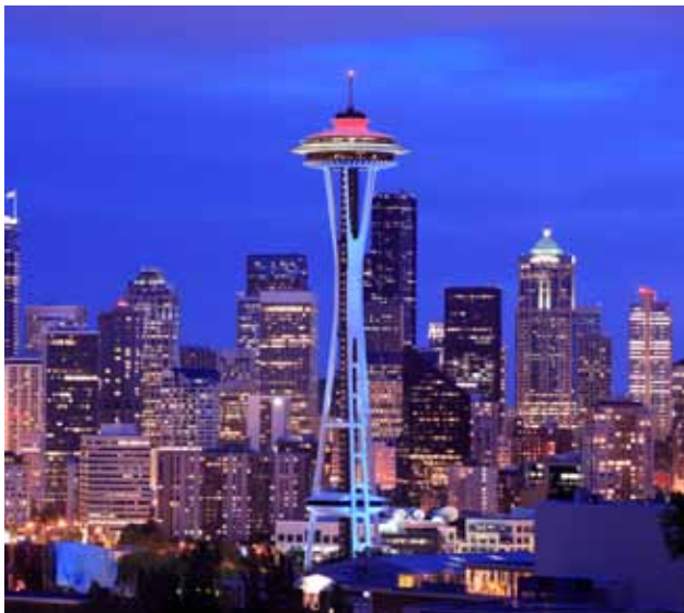
Seattle at night

The Kaplan Seattle center is located right in the heart of Seattle’s University District. Restaurants and shops surround the center, and the location is also ideal for meeting American students. This neighborhood also has many free wireless access options, including a free connection at the Kaplan center.