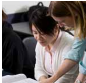
Kaplan teacher with students