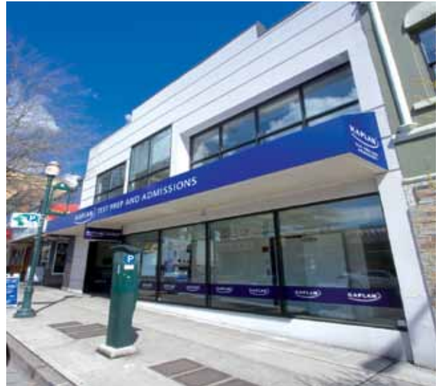
Kaplan International Center Seattle

To get to the Seattle Kaplan center from the airport, take either the light rail or bus number 194 to downtown, and then transfer to route number 71, 72 or 73 going to the University District. The bus route will take you directly to the Kaplan center at 4216 University Way NE. You can also pay for a cab from the airport to the school or to your accommodation.