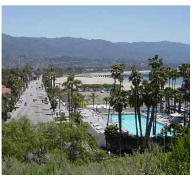
Swimming pool on campus