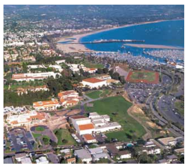
Kaplan international Center at Santa Barbara City College

Santa Barbara City College is located right on the beach in a residential area of Santa Barbara called The Mesa. Kaplan is located in a modern, California-style building on the Santa Barbara City College campus. The center is only 5 minutes away from the downtown area of Santa Barbara.