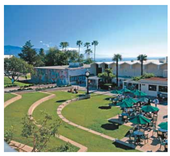
A recreational area at Santa Barbara City College

If arriving at Santa Barbara Airport, you can take a taxi to your homestay, for $20- $40. If arriving at Los Angeles International Airport, you can book the Santa Barbara Airbus (www.sbairbus.com) for $42 one-way, and then take a taxi from the bus stop to your homestay (approximately $20-$40).