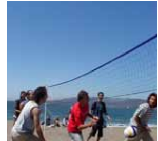
Students playing volley ball