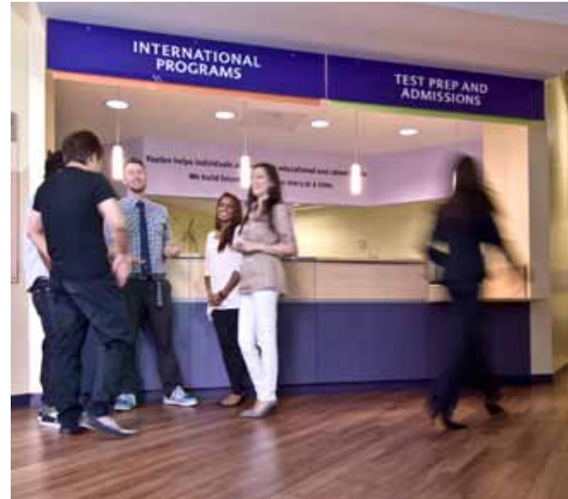
Kaplan International Centre