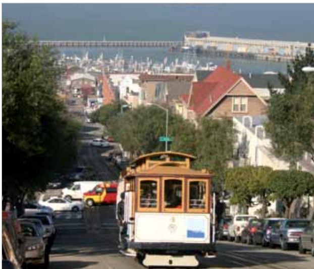
View of San Francisco

The center is located on the first and second floor of an historic and fully refurbished building in the heart of San Francisco. Between the financial and commercial areas, the center is located on a two-block stretch of the premier student area of downtown San Francisco, surrounded by Academy of Art and Golden Gate University. The Kaplan Center is only two blocks from San Francisco's central thoroughfare, Market Street, one block from the Museum of Modern Art and a short ride on the historic F tram from the Ferry Building, Pier 39 and Fisherman's Wharf.