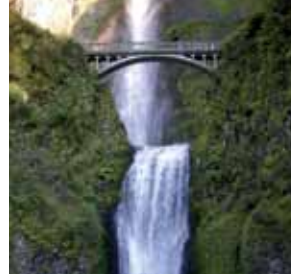
Enjoy the beautiful scenery in Oregon

Public telephones can be found throughout the downtown area and wireless internet is widely available. Computer stations can be used at the nearby public library.