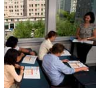
A classroom at Kaplan's Portland Center