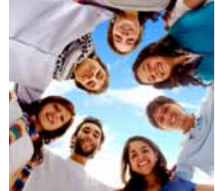
Make new friends