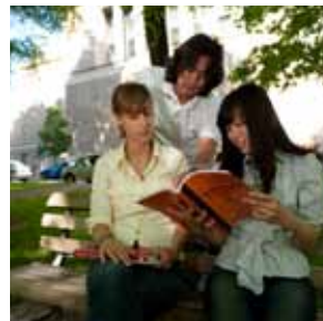
Study in a sociable atmosphere