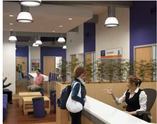
Kaplan Center Portland

To get to the Portland Kaplan center from the airport, take the MAX Red Line to City Center and Beaverton TC. Get off at the Galleria/ Library MAX station. Take the street car North for 3 stops and get off at NW 10th and Everett. Walk West to NW 13th Street and Everett. Our building is at 323 NW 13th Ave. Enter the building and take the elevator to the 3rd floor.