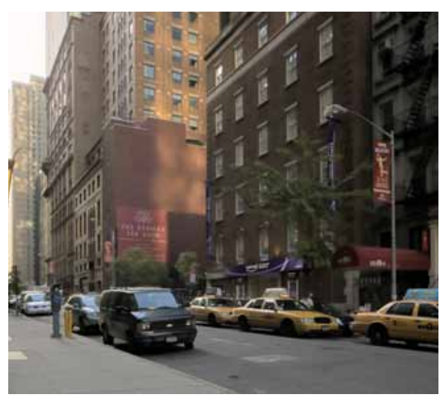
Kaplan International Center Midtown

Our Manhattan international center is a beautiful, 6-storey building located in the heart of Midtown Manhattan - just steps away from everything that makes New York, New York. Carnegie Hall, the Theater District (Broadway), Rockefeller Center and Central Park are all within a 10 minute walk from our front door! Even better, we're less than a 5-minute walk from four of the five major subway lines that can take you to your accommodation, and every place in the city you'll want to visit.