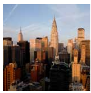
New York skyline