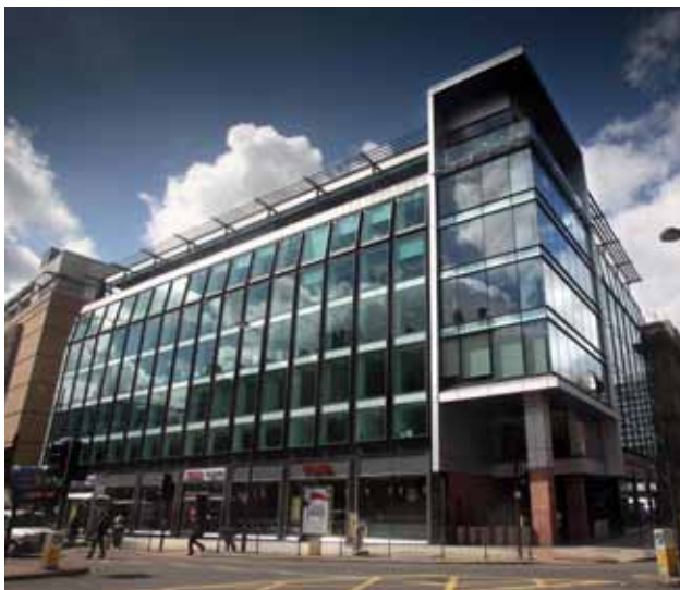
Kaplan International College Manchester

The college is centrally located on Portland Street, within walking distance of a variety of restaurants, bars and theatres. Facilities include large, well-equipped classrooms, a multimedia centre and a student common room with internet access.