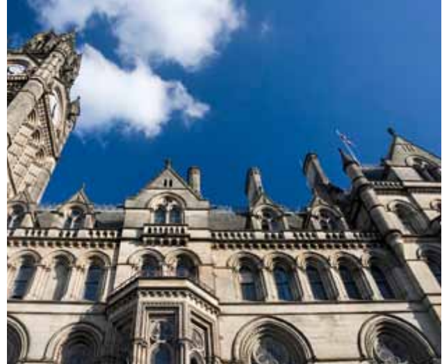
Manchester Town Hall

The Station, Manchester Airport's integrated transport hub, offers fast and frequent train, tram and bus services to the centre of the city. There is a train which goes directly from the airport to Piccadilly Train Station, the nearest station to the Kaplan college. The bus from Manchester airport to town costs maximum £3.50.