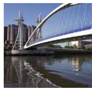
Bridge at Salford Quays