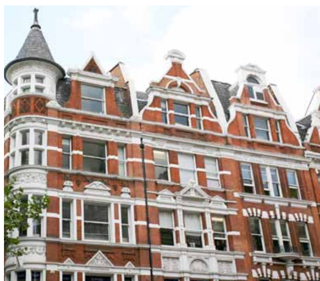
Kaplan International College London, Leicester Square

London is one of the world's remarkable and exciting cities. Marvel at its fantastic diversity of population and lifestyles reflected through its wide-ranging cuisine, eclectic shops, thriving music scene and wonderful West End theatres. Admire the spectacular view of the city on the London Eye, or explore the sights such as Big Ben, Buckingham Palace and the Tower of London. There is always something to do in London!