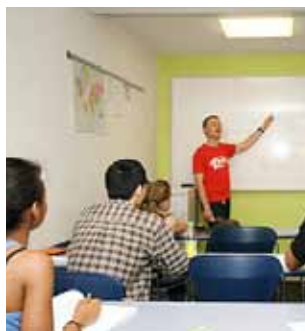
Kaplan students in a classroom

Kaplan arranges a full schedule of excursions and activities including excursions to the famous museums, clubbing evenings in Soho and West End theatre trips.