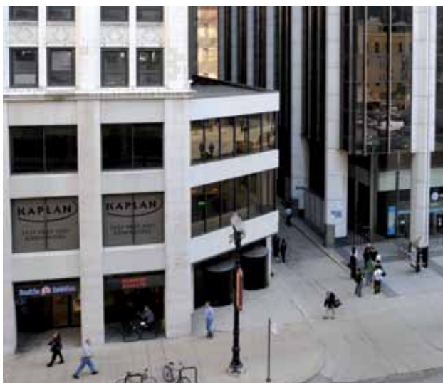
Kaplan International Center Chicago

With Kaplan International Center Chicago, you will really be able to make the most of your experience. We offer a full range of programs, from General English to TOEFL® and Academic English, to GMAT® and GRE® for International Students. We are certain that you will enjoy your study and your stay at our center.