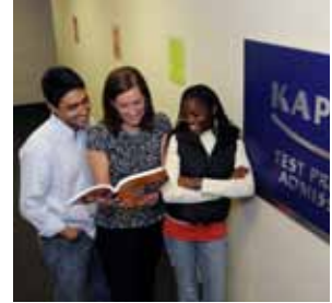
Kaplan International Center teacher and students