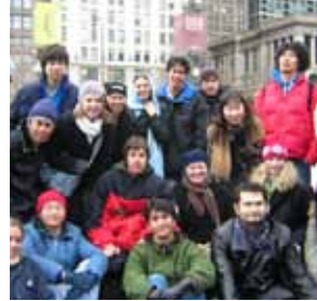
Kaplan International Center students ice skating

The school has wireless internet access, internet kiosks and a computer lab. There are several companies offering very reasonable deals on cellphones, and international calling cards are also available.