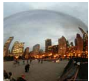
Millennium Park Bean Sculpture