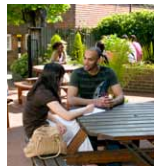
Students in the outdoor patio area