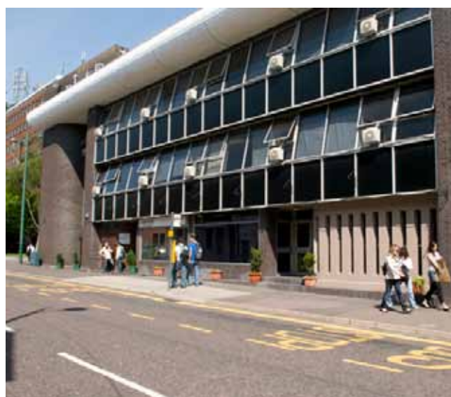
Kaplan International College Bournemouth

The college was built in the 1960s. It is a modern building with three floors and is situated in the area of Westbourne, roughly 5 minutes by bus from Bournemouth town centre. The college is located on a main street and has a lovely patio at the back.