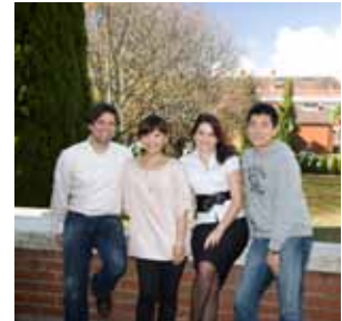
Study in beautiful surroundings