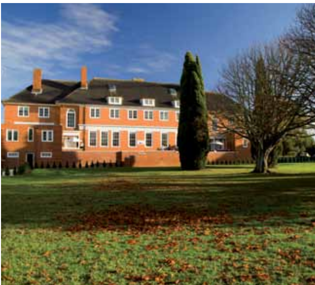
Kaplan International College Auckland

The Auckland college is located in one of the city's most popular areas between the Domain, a beautiful public park, and the lively Newmarket district, with its chic shops, bars and cafes. It is also just a 5 minute walk from Parnell Village with its unique colonial atmosphere.