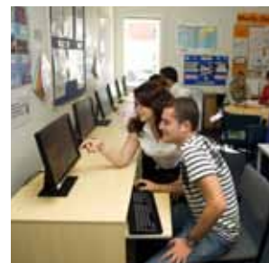
Study centre / library