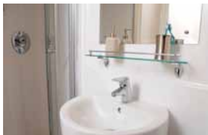
Ensuite shower room