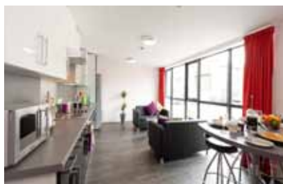
Kitchen with living and dining area