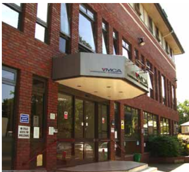
The YMCA Residence

Each study bedroom has a single bed with bed linen provided, fridge/freezer, wash basin, shaver socket and wireless internet access. Kitchens are well-equipped, enabling students to easily cater for themselves.