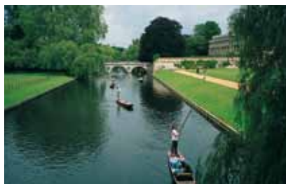
The River Cam