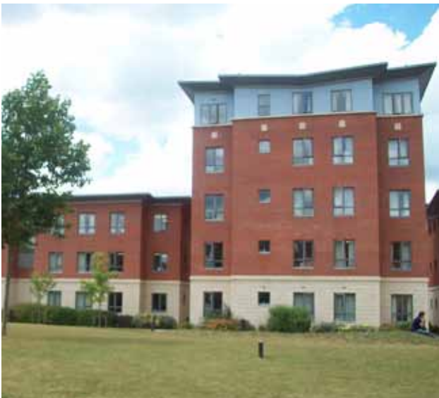
Tripo Court Residence

Living in Tripo Court you'll share a spacious kitchen and walk-through dining and lounge area, which is great for socialising and catching up with friends. In addition to landscaped gardens, Tripo Court features an on-site laundry; access to broadband Internet (there is an additional charge), plus the complex is covered by 24/7 CCTV and swipe-card entry, ensuring peace of mind.