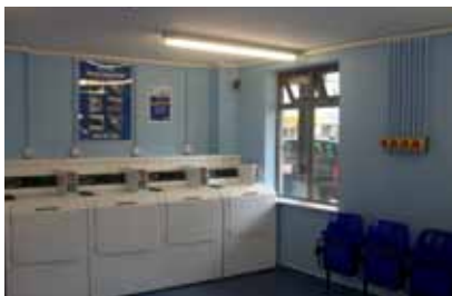
On-site laundry facilities