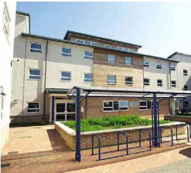
Sedley Court Residence

Residents at Sedley Court can enjoy wireless internet access for a one-off registration fee, and also benefit from a communal laundry facility and a residence office staffed 24 hours a day, 7 days a week. Furthermore, a gym, swimming pool and mosque are all within a 15-minute walk.