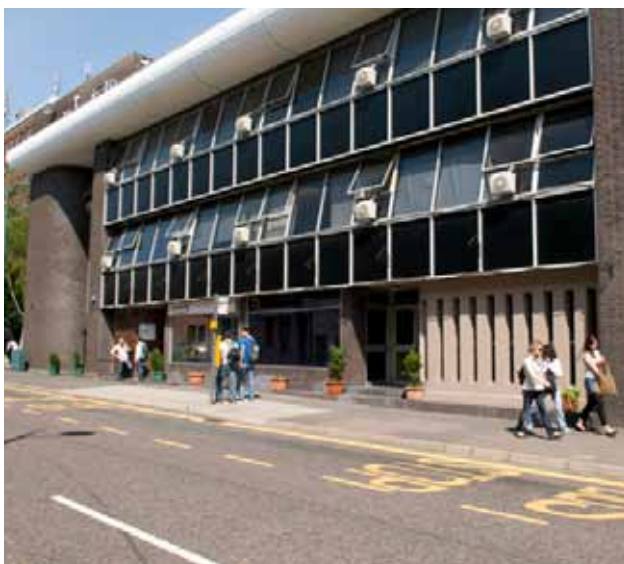
Kaplan International College Bournemouth

The Bournemouth College is an official IELTS Test centre for Kaplan students only. It is also a Cambridge computer based test centre for KET, PET, FCE and CAE, ensuring exams are taken at college in familiar surroundings.