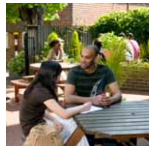
Students in the outdoor patio area