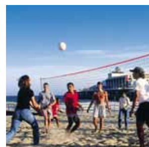
Kaplan students enjoying a game of volleyball on the beach