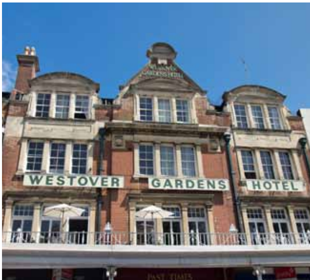
The Westover Gardens Hotel

Residents benefit from a television and games room, which provides a great place to socialise and relax. Other features of Westover Gardens include a weekly cleaning and linen-change service, free WIFI connectivity and an on-site live-in management team.