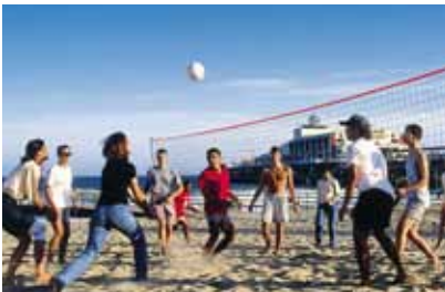
Students enjoying a game of volleyball on Bournemouth beach