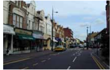
The seaside town of Bournemouth