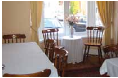
Communal dining room