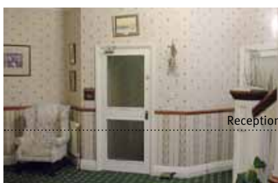
Upton Apartments - Corridor