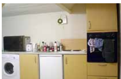
Upton Apartments - Kitchen