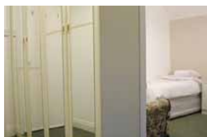
Upton Apartments - Bedroom