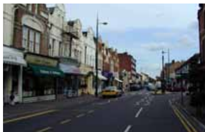
The seaside town of Bournemouth