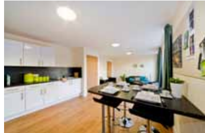
Communal dining room and kitchen