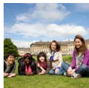
The Royal Crescent