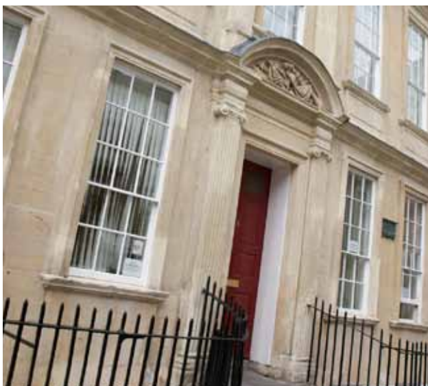
Kaplan International College Bath

Our Bath college is based in comfortable historical buildings right in the heart of the city, less than one minute's walk away from shops, cafés and restaurants. Pleasantly furnished classrooms are complemented by a computer centre and library, together with a common room where students can relax over a cup of tea or coffee. A tranquil courtyard garden offers a sanctuary in which to work or socialise outside.