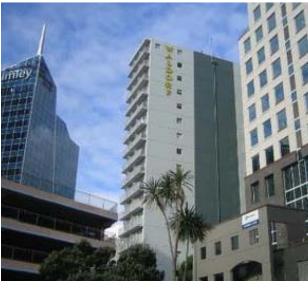
Waldorf Tetra Apartments

Waldorf Tetra Apartments offers fully-furnished 1 bedroom un-serviced self-contained apartments. This form of accommodation allows students the ultimate in flexibility and privacy. The apartments offer the comfort of a home away from home and the amenities of a hotel. There is an optional telephone and high-speed internet service and an on-site gymnasium.