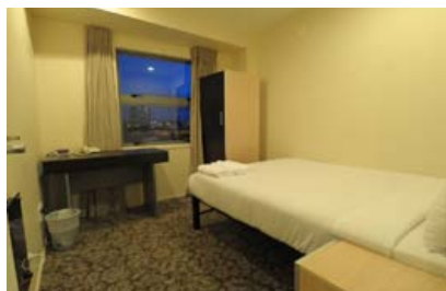
Single room (3-bedroom shared apartment)