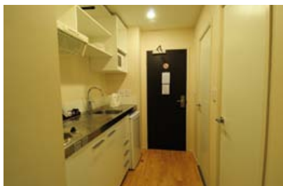
Kitchenette (3-bedroom shared apartment)