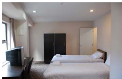
Twin room (studio apartment)